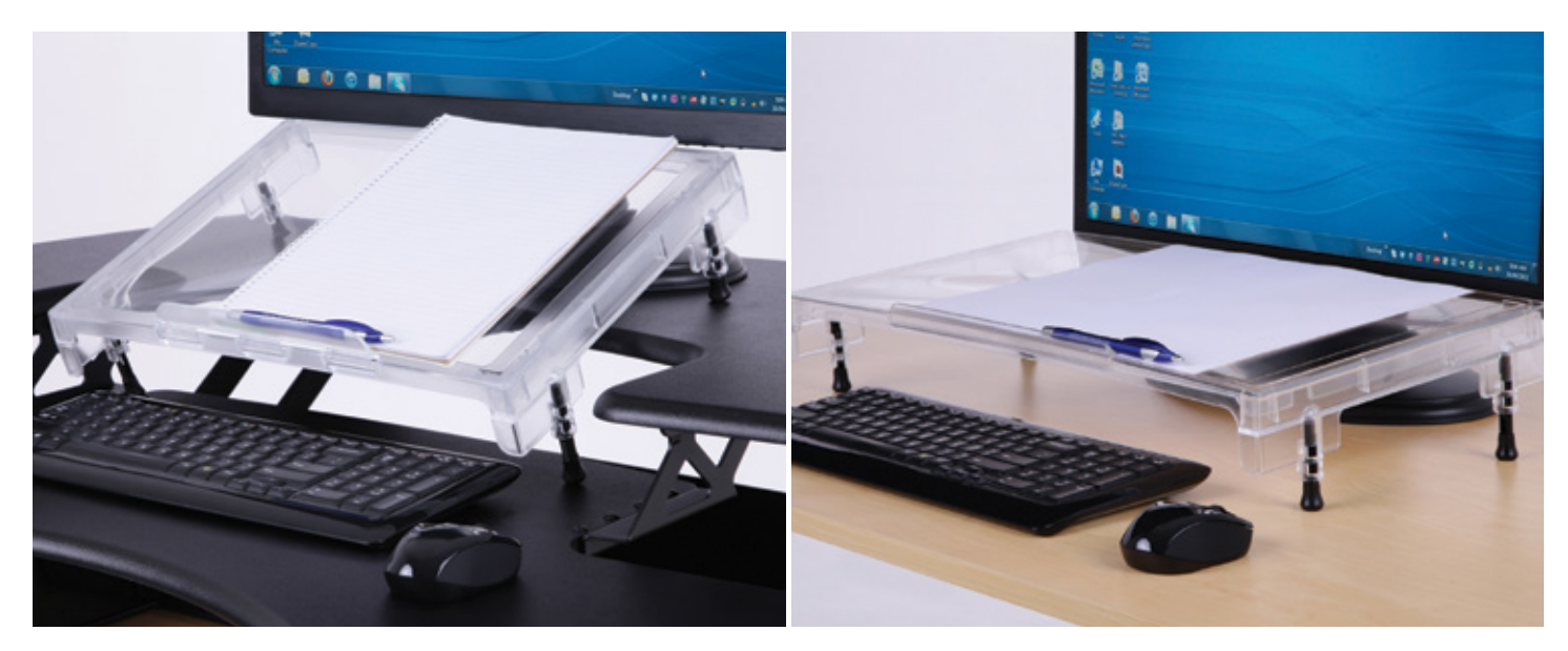
PICTURED: Compact MICRODESK™ with Straight Sides on Varidesk Pro Plus 36 sit-stand solution.

PICTURED: Compact MICRODESK<sup>™</sup> with Straight Sides on Ergotron Workfit TL sit-stand solution.